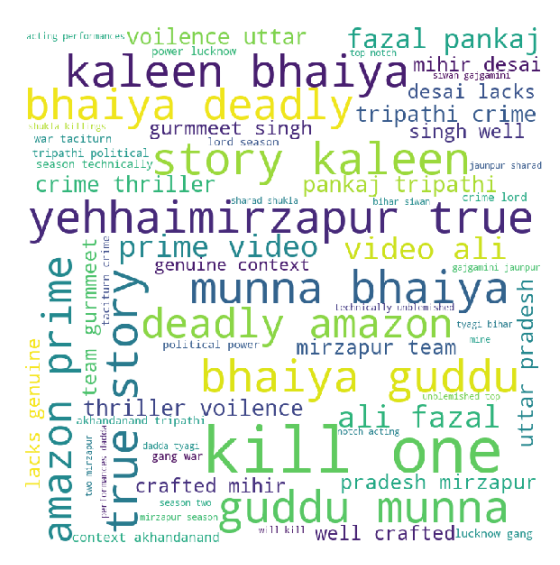
Fig. 4: Figure Shows the Word Cloud Created from Tweets Related to the Web Series Mirzapur 2

Based on the analyzed tweets included in the text file "mirzapur2.txt", the word cloud has been obtained as shown in Fig. 4. The bigger is the size of the text in the word cloud, the more frequently the word occurred in the tweets and vice versa. The word cloud prominently illustrates the names of different characters and genres of the web series.