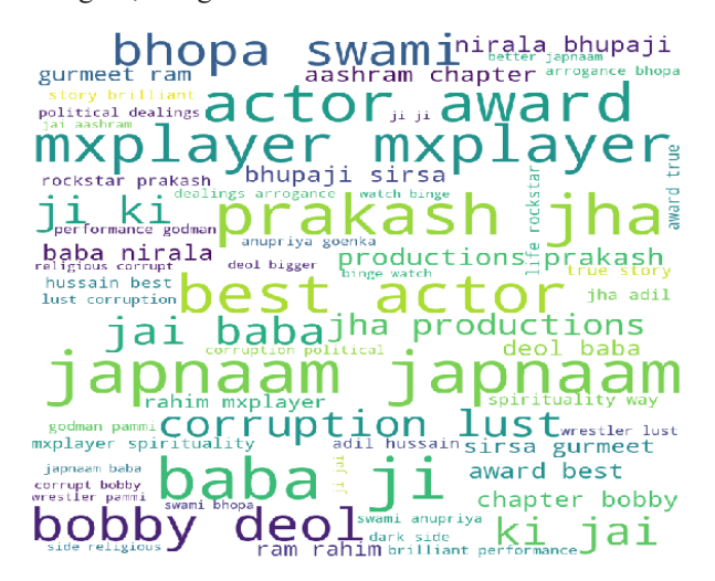
Fig. 5: Figure Shows the Word Cloud Created from Tweets Related to the Web Series Aashram Chapter 2

Based on the analyzed tweets included in the text file " aashram2.txt ", the word cloud has been obtained as shown in Fig. 5. The bigger is the size of the text in the word cloud, the more frequently the word occurred in the tweets and vice versa. The word cloud prominently illustrates the names of different characters, popular dialogues, and genres of the web series.